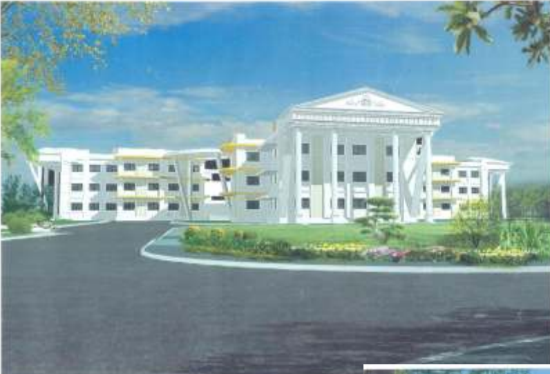
Proposed Building to house 65 Class Rooms.

As part of the Infrastructure development, the Management has proposed to construct three Buildings at an estimated cost of nearly Rs.15 crores. Plans have been submitted to the Tiruchi Corporation and on getting the approval of the authorities work will start immediately.