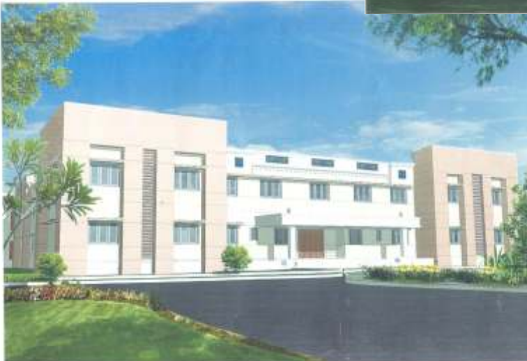
Proposed Ladies Hostel with 84 Rooms. This Building is partly financed by UGC.