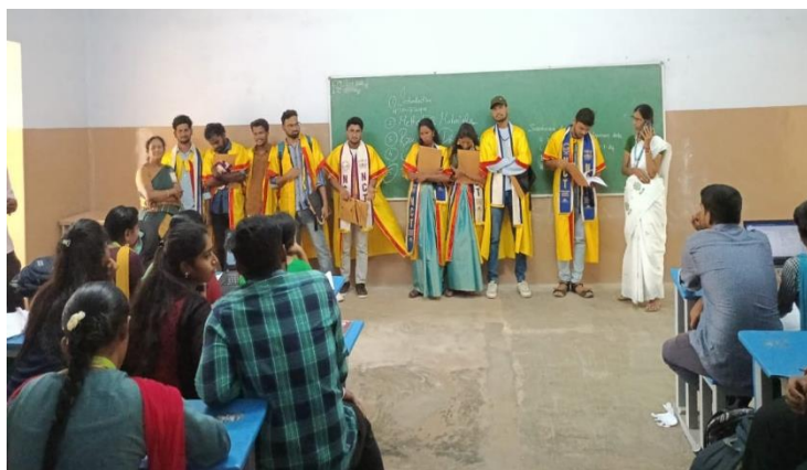
M.Sc. Chemistry Seniors