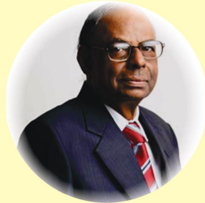
Padma Vibhushan Dr. C. Rangarajan Endowment Lecture - VI

Nationally Re-accredited with 'A+' Grade by NAAC College with Potential for Excellence Tiruchirapalli-1.