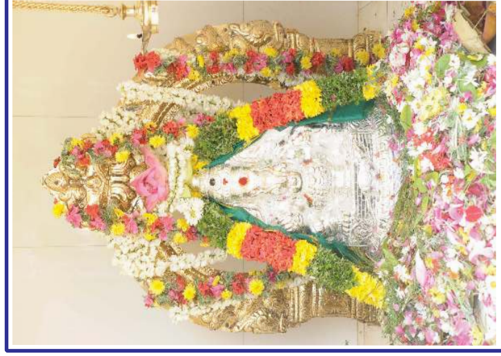
Lord Vidhya Vinayagar