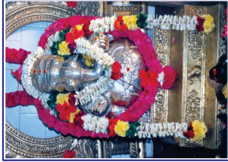
Lord Jaya Vinayagar